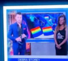
CHANNEL 8 2021 HOUSE OF FASHION SHOW INTERVIEW