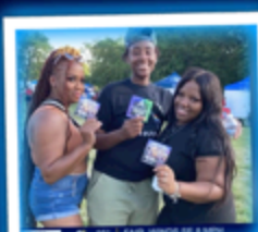
CHANNEL 8- LV NOW 2021 HOVP FESTIVAL COVERAGE