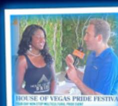
FOX 5 LIVE 2022 HOUSE OF FASHION SHOW INTERVIEW