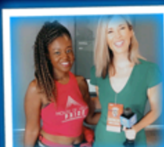
CHANNEL 13 LAS VEGAS AVIATORS PRIDE NIGHT BASEBALL GAME